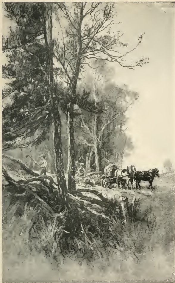
How bow'd the woods beneath their sturdy stroke